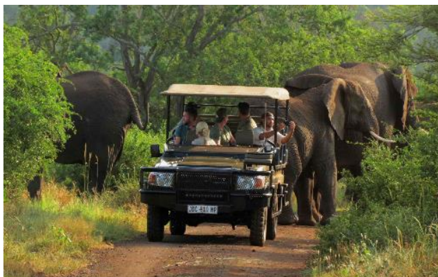
Open safari vehicle for certain game drives