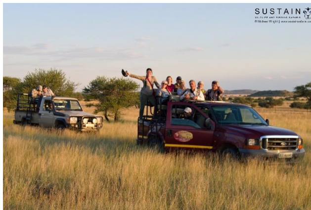
Open safari vehicle for Marrick game drives