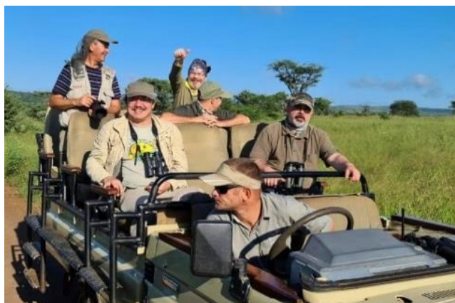
Open safari vehicle for certain game drives