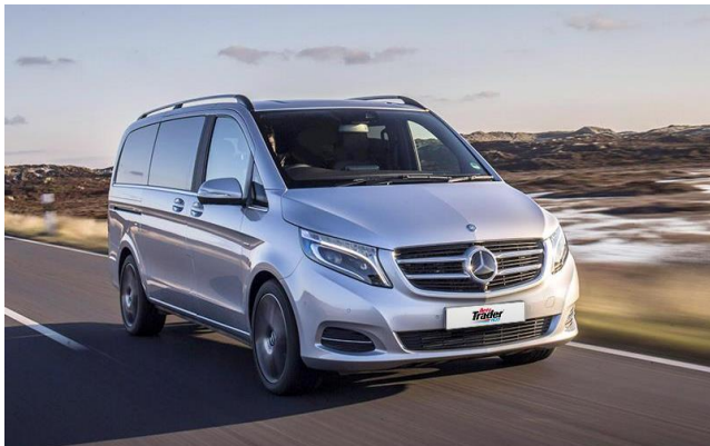
General tour travel vehicle

All ground transport travel by the group will be in a Mercedes Benz Vito vehicle, and open safari viewers will be used in select game viewing destinations.